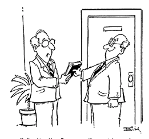
"What's this?...IOOI Easy Steps to Congregational Organization?"

Since then, neither God nor Man has rested.