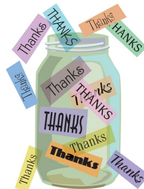
Overflowing With Thanks

Thank you for my wonderful Christmas gifts. The stole is beautiful and will be seen on Easter. And the money gift was very generous.