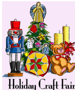
Holiday Craft Fair

30+ Craft Vendors will help you get into the holiday spirit and Santa will be making an appearance from 10 a.m. until 2 p.m. (so bring the kids!). There will be activities, food, raffle, face painting and so much more! Please support the concession stand run by F.A.M.E. (Friends of Auburn Music Education). Look for a schedule of events in the Auburn News or go to www.auburnguide.com . For more info please call 508-832-7736 or email: kpappas@town.auburn.ma.us