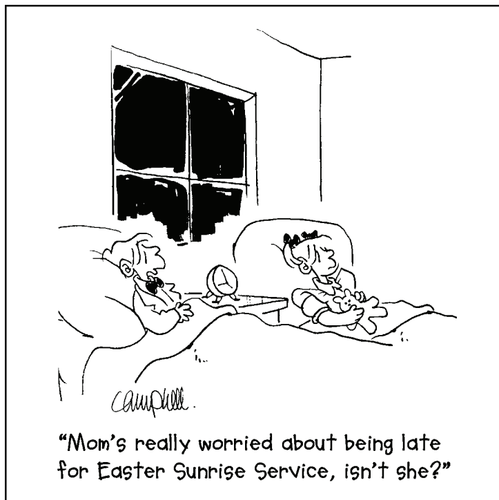
“Mom's really worried about being late for Easter Sunrise Service, isn't she?”

We will continue to collect children's books for New Orleans, and also musical instruments. Thank you for your donations to this worthy cause.